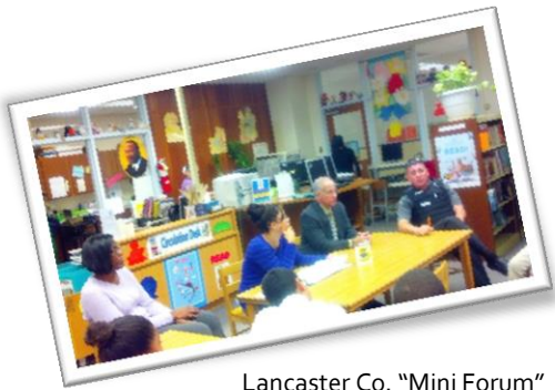
Lancaster Co. “Mini Forum”

View the acceptance speeches via YouTube: http://www.youtube.com/watch?v=Ho1QXzJK_I