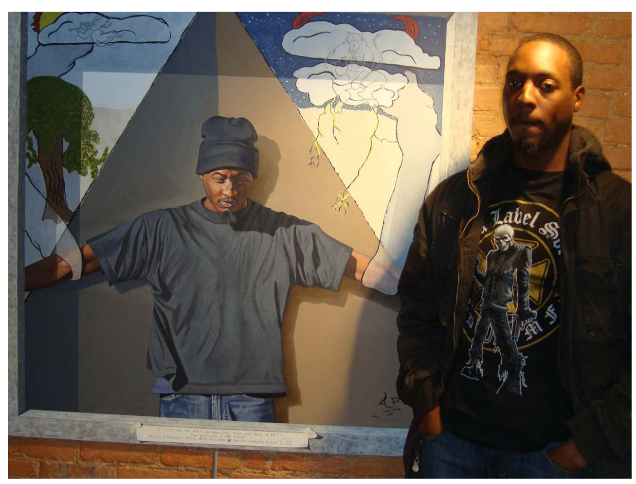
Self-portrait of program participant